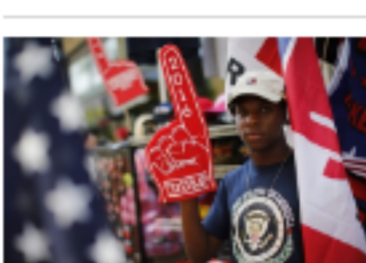
Republican National Convention: Day Two