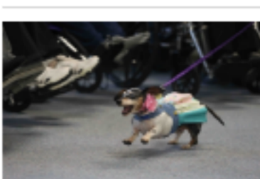
Rescue dogs walk the runway