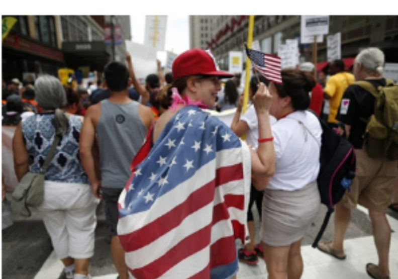
Protests and Demonstrations outside the Convention